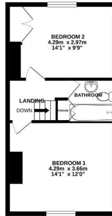
1ST FLOOR 34.3 sq.m. (370 sq.ft.) approx.